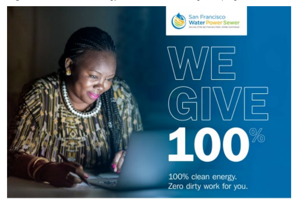
Figure 2. Renewable Energy Ordinance Marketing Campaign

As part of the outreach plan, CleanPowerSF is offering consultations for current and prospective customers and will provide cost estimates and comparisons, service information, and guidance on the upgrade process.